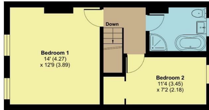
FIRST FLOOR APPROX FLOOR AREA 35.7 SQ M (385 SQ FT)